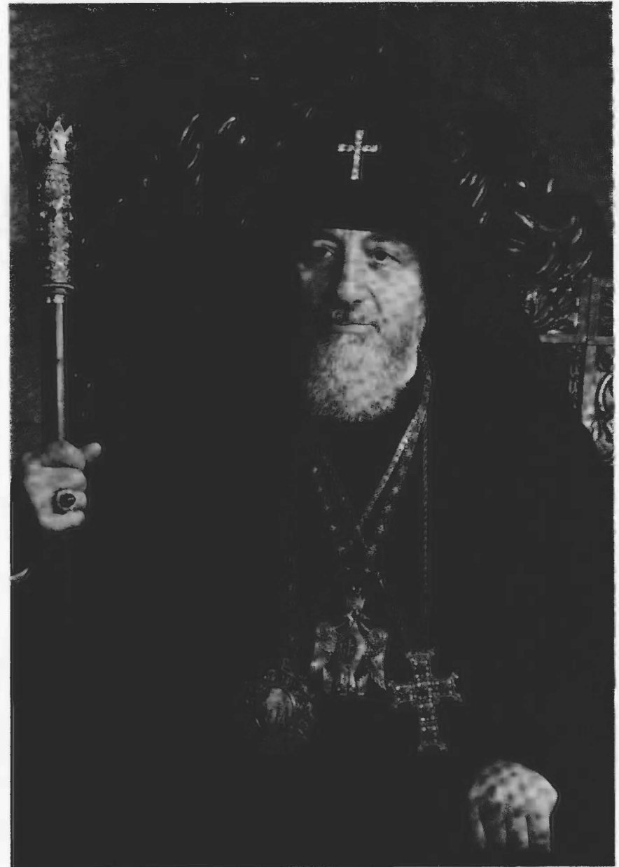
His Holiness Vasken I Supreme Patriarch, Catholicos of All Armenians