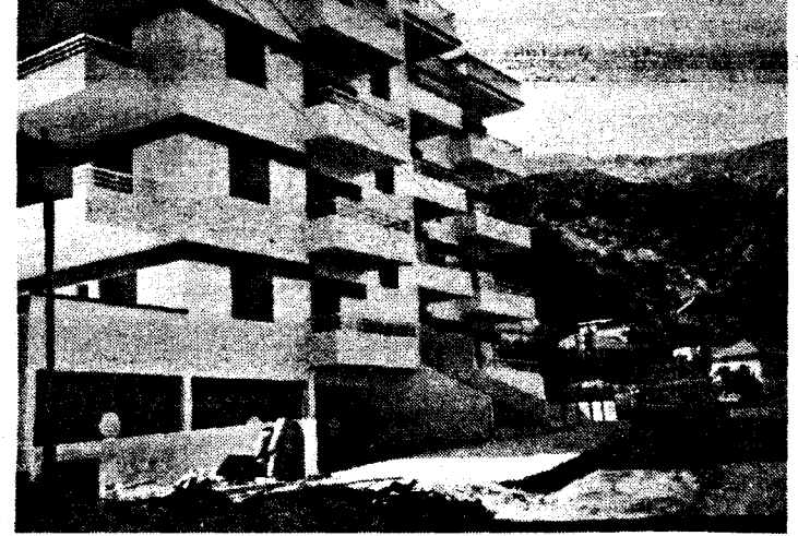
"DOWNTOWN" KESSAB. A new apartment complex is a sign of the times. There is a construction boom even in Kessab!