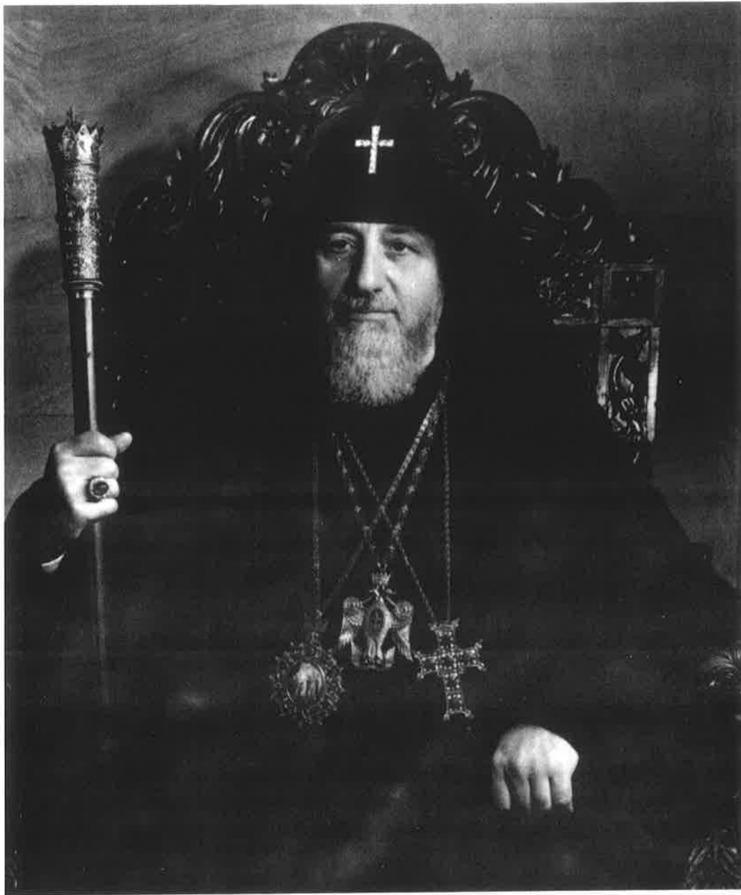
His Holiness Vasken I Supreme Patriarch and Catholicos of all Armenians