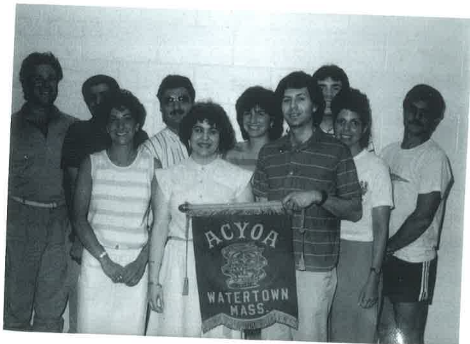
Watertown - The Bay State is Sailing Down to the Ocean State "Catch the Hye Spirit" Fever !! Good Luck