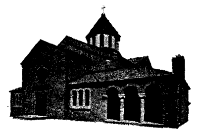
Area Code 216-Tel. 381-6590