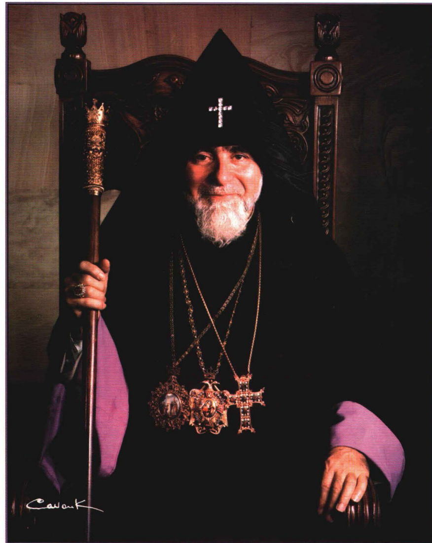
His Holiness Karekin I Supreme Patriarch and Catholicos of All Armenians