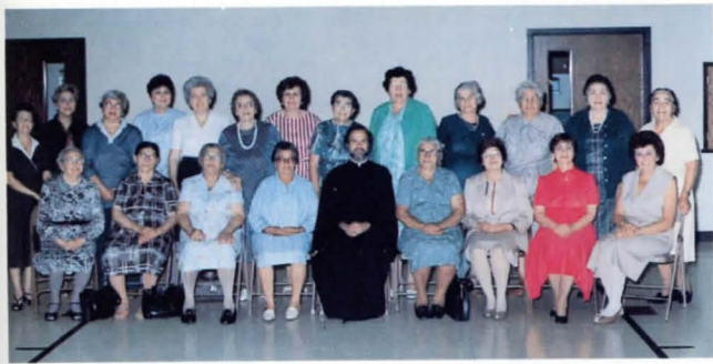
Altar, Mahts, Flower Committee