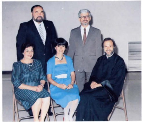
Armenian School Teachers