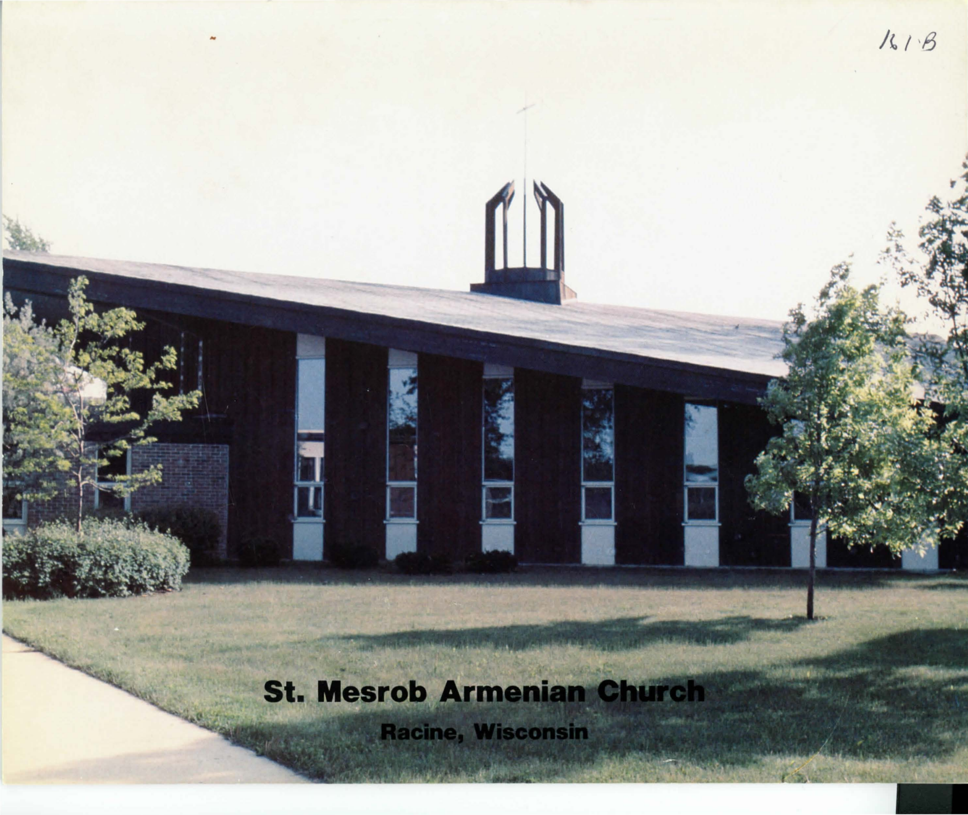
St. Mesrob Armenian Church Racine, Wisconsin