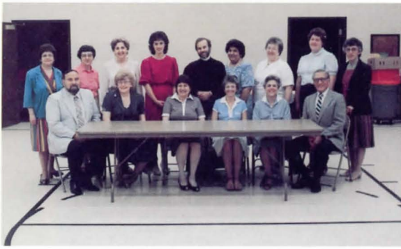
Sunday School Staff