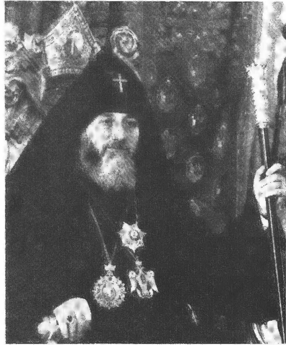
His Holiness Vasken I Supreme Patriarch and Catholicos of all Armenians