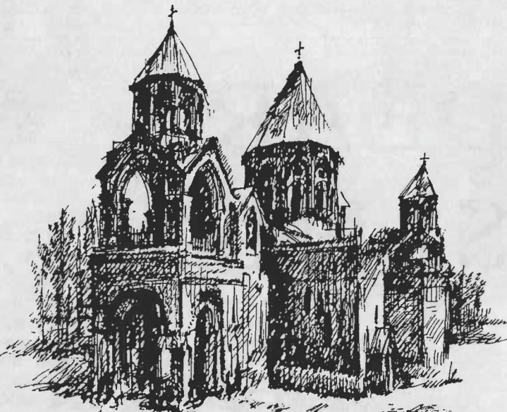
The Cathedral of Holy Etchmiadzin

The Armenian Church, along with all the Lesser Orthodox Churches, the Greater Orthodox Churches, and the Roman Catholic Church have a very important point in common. That common point is APOSTOLIC ORIGIN .