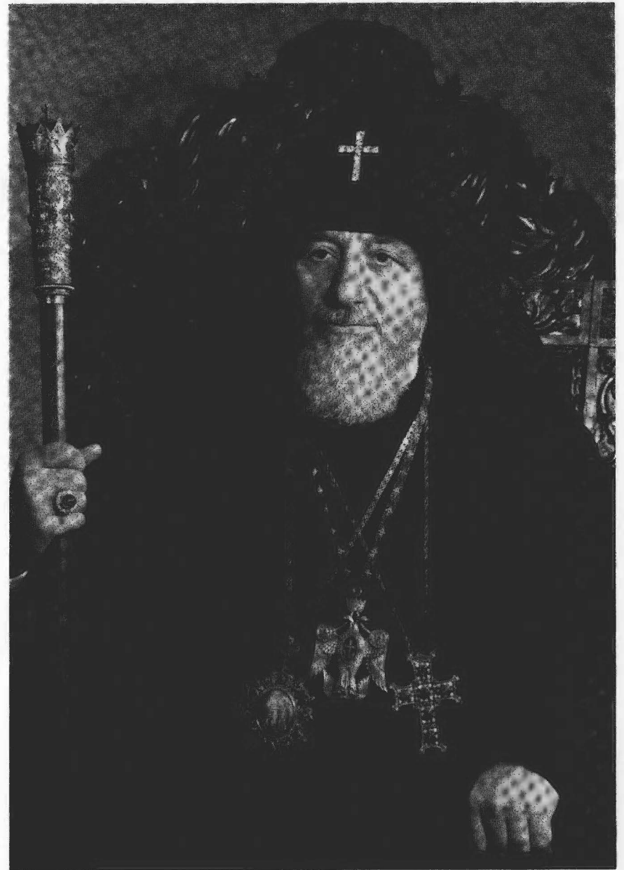
His Holiness Vasken I Supreme Patriarch, Catholicos of All Armenians