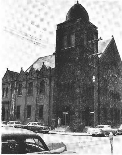
Our House of Worship (1941-1964)