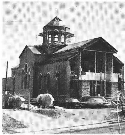
The New Church Under Construction