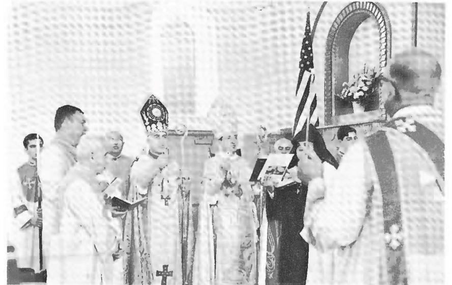
Consecration — September 18, 1966