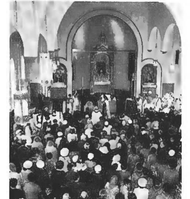
The Visit of His Holiness Vazken I — May 8, 1968