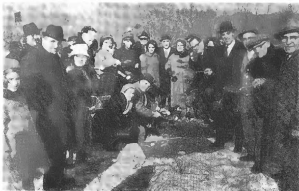
Groundbreaking Ceremony — January 31, 1965