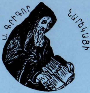
ST. GREGORY OF NAREK