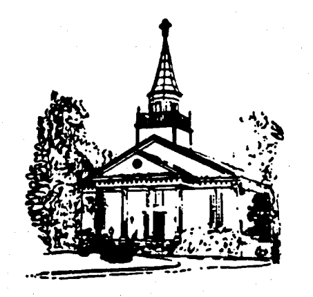
ՍԲ. ՀԱՄԲԱՐՁՈՒՄ ՀԱՑծ. ԵԿԵՂԵծԻ 8. ԸՆՁԱԿ ՔՀՆՑ. ՆԱԼՊԱՆՑԵԱՆ, Հովիւ