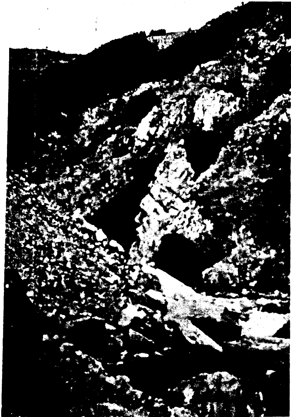
The profile of St. Vartan sculptured by nature near Chermoog, Armenia (story on back cover)