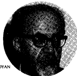
ARCHBISHOP TIRAN NERSOYAN