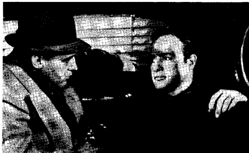
ON THE WATERFRONT